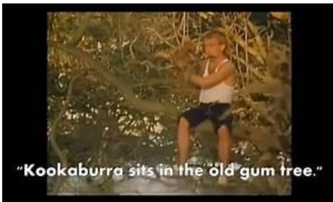
Comparison of Down Under (Men at Work) and Kookaburra Sits in the Old Gum Tree - YouTube