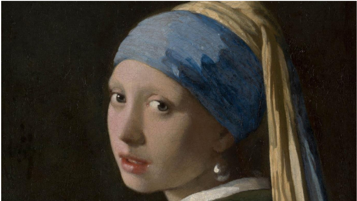
Girl With a Pearl Earring: Johannes Vermeer c.1665, Mauritshuis, The Hague