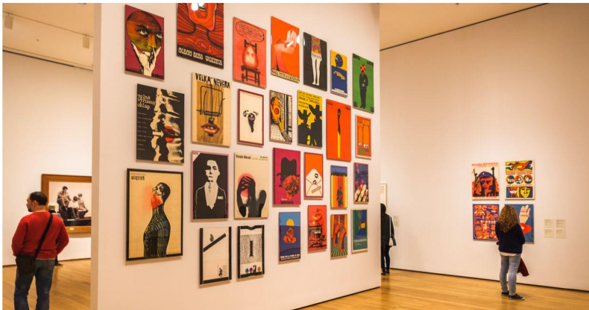
AI on display

Downloaded from: An AI-Generated Artwork Won First Place at a State Fair Fine Arts Competition, and Artists Are Pissed (vice.com)